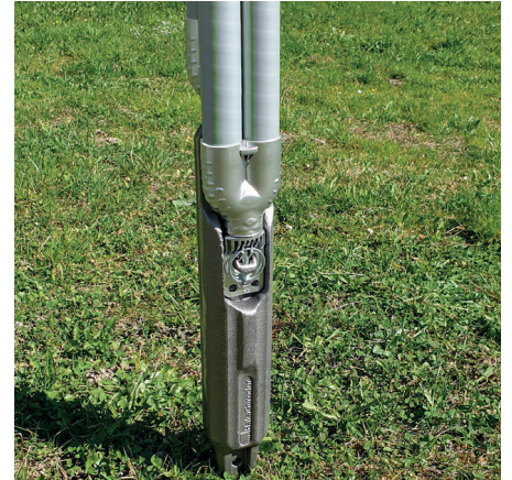
5 Standard cast weight fitted to the probe foot