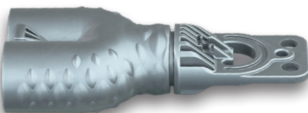
3 Probe foot with vapour-deposited metallic film layer and protective lacquer coating