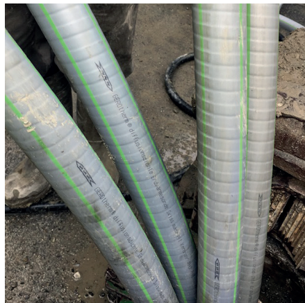
6 Flow direction arrows and metre marks on both sides similar to standard probes.