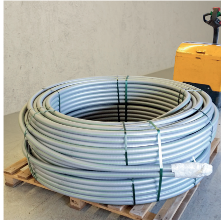
4 Complete GEROtherm®-REX geothermal probe designed as a 40 mm single-U

The version -REX is available for the probe types DUPLEX, VARIO and FLUX .