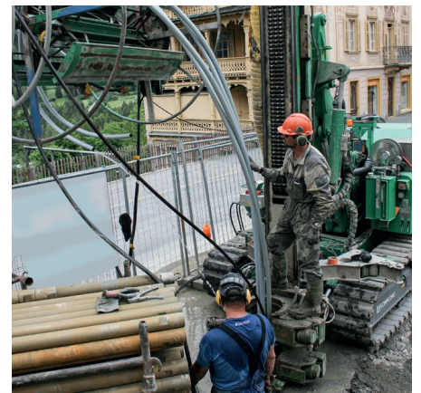
8 The final metres when sinking a total of five double-U40 mm GEROtherm®-REX probes into the drill hole, each 152 m in length