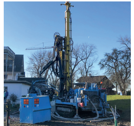
7 GEROtherm®-REX in the drill hole with the drilling rig in the background